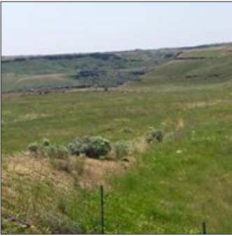
Mullan Trail ruts