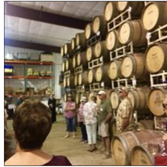
Gordon Winery tour