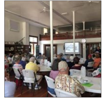
Lunch and lecture at Hooper